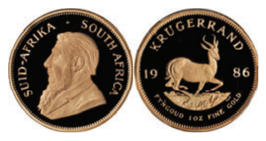
In 1986, 21,040 1-oz Proof Krugerrands were minted, while no circulation issues were produced. Hammer price: ca. EUR 1,250. Original: 32 mm. From Stack's auction ANA (2016), lot No. 21486.

If you compare the prices of rare years with those of years in which millions of Krugerrands were produced, it quickly becomes clear that these coins are still being sold well below their true value. From the very beginning, Proof issues have also been minted. They have a much lower mintage figure and are sold to collectors at prices above their gold value. Here, too, you can still make a real bargain: the depicted PP Krugerrand is from the extremely rare year of 1986, but it was sold in 2016, when the gold price was ailing, for about 1,250 euros – in 2023, you would have to pay around 500 euros more for a new circulation Krugerrand sold at the price of its gold content!