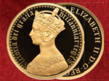
Great Britain: Elizabeth II gold Proof "Gothic Crown Portrait" 2000 Pounds (2 Kilos) 2021 PR70 Ultra Cameo NGC Realized $180,000