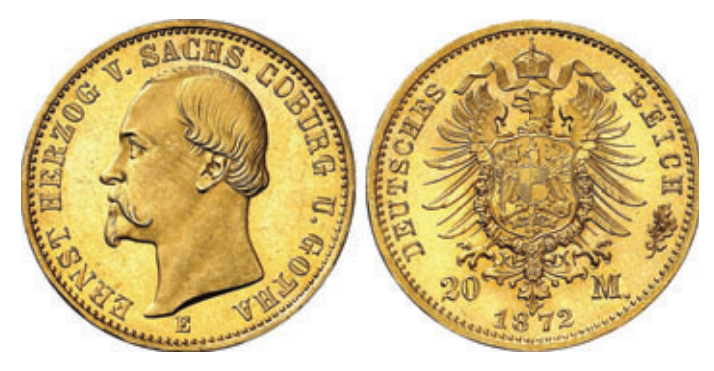
The 20 mark coins by Duke Ernest II of Saxe-Coburg and Gotha are considered the rarest gold coins of the German Empire. Hammer price: EUR 135,000. Original: Ø 22,5 mm. From Grün auction 74 (2018), lot No. 2306.

their rarer coins, depending on each collector's individual budget. As well as rarity, quality is the crucial factor when it comes to determining the price of a gold coin of the German Empire. Pay close attention to a coin's quality in or-