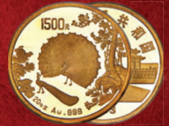
China: People's Republic gold Proof "Peacock" 1500 Yuan (20 oz) 1993 PR69 Ultra Cameo NGC Realized $216,000