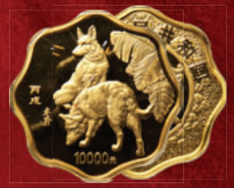
China: People's Republic gold Proof Scalloped "Year of the Dog" 10000 Yuan (Kilo) 2006 PR68 Ultra Cameo NGC Realized $180,000

For a free appraisal, or to consign to an upcoming auction, contact a Heritage Consignment Expert today. +1 214-409-1005 or WorldCoins@HA.com