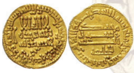
Dinar of Harun al-Rashid from 189 AH = AD 805. Estimate: EUR 125. Hammer price: EUR 230. Original: Ø 19 mm. From Teutoburger Münzauktion auction 89 (2015), lot No. 19.

supply, the production of gold coins shifted to the Orient. Medieval Islamic gold coins are common and – with the exception of great rarities of utmost historical importance – still relatively affordable. However, this field requires a lot of expertise on the part of the collector. And knowing a little Arabic is a must if you want to collect these pieces. An alternative are medieval European coins, which are still comparatively