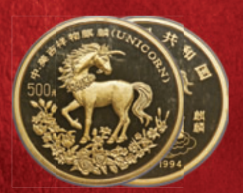
China: People's Republic gold Unicorn Proof 500 Yuan (5 oz) 1994 PR69 Ultra Cameo NGC Realized $50,400