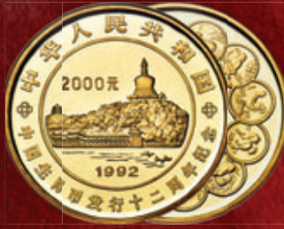
China: People's Republic gold Proof "Completion of Lunar Cycle" 2000 Yuan (Kilo) 1992 PR69 Ultra Cameo NGC Realized $576,000