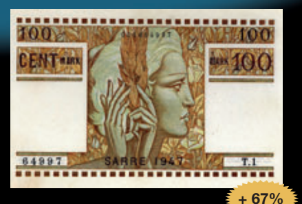
Lot 4328 SAARMARK MARK Emergency money 100 Mark, Germany, 1947. Estimate: € 6.000 Hammer Price: € 10.000

Lot 4045 AUSTRIA Austro-Hungarian Bank. 20 Kronen 31.03.1900. Estimate: € 100 Hammer Price: € 1,050