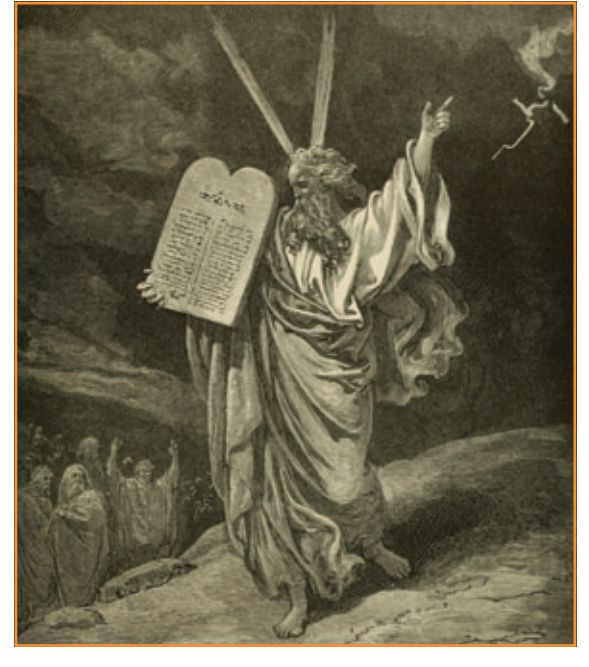
With our ten commandments you are on the safe side when buying gold.

You have to decide for yourself whether a source is reliable or not. Of course, there are helpful indicators such as ratings from neutral trade magazines or the membership in an association. The very fact of how long a particular company has been in business tells you a lot about