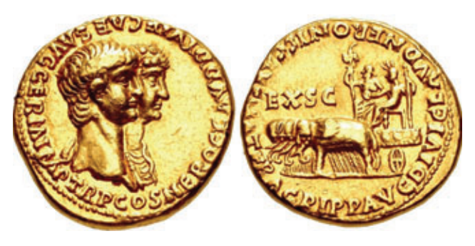
Aureus of Nero with his mother Agrippina, whom he was to kill later. Estimate: USD 20,000. Hammer price: USD 26,000. Original: Ø 18 mm.