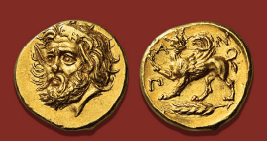
Tauric Chersonesus, Panticapaeum, Ex NAC Auction 138, lot 155 Estimate: 1'250'000 CHF / Realized: 4'400'000 CHF