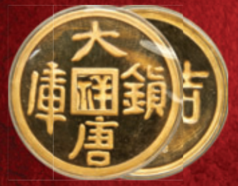
China: People's Republic gold Proof "Vault Protector" 15 Ounce Medal ND (1989) Realized $50,400