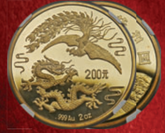
China: People's Republic gold "Dragon and Phoenix" Proof Pattern 200 Yuan 1989 PR69 Ultra Cameo NGC Realized $408,000