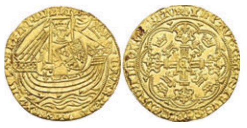
This noble was minted under Edward IV in 1464 by the London Tower Mint. Its unusually high price is due to the fact that, according to NGC, this is the best-preserved specimen and was graded MS64. Estimate: CHF 2,500. Hammer price: CHF 75,000. Original: Ø 34 mm. From Sincona auction 72 (2021), lot No. 536.